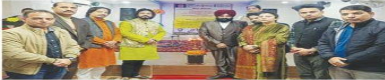
Top News Report