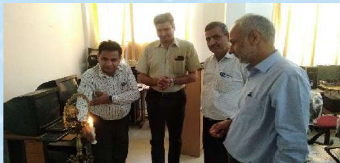
Lighting of the traditional lamp by the dignitaries