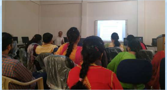
Technical session of the workshop on 'Basics of Computers'