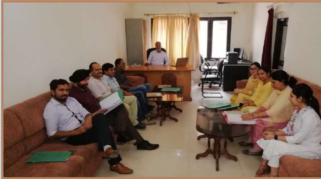
IQAC meeting in progress

Realizing the role of IQAC for institutionalizing quality to achieve excellence, the College administration established a secretariat for IQAC, that is equipped with all the infrastructure and the manpower to facilitate the result oriented functioning. The technical support is also available to IQAC through a whole time computer assistant.