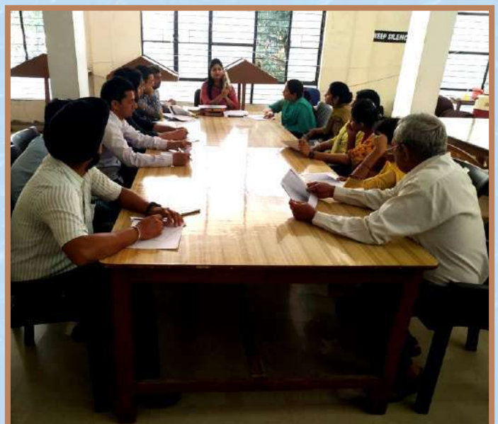
Technical session of the library workshop