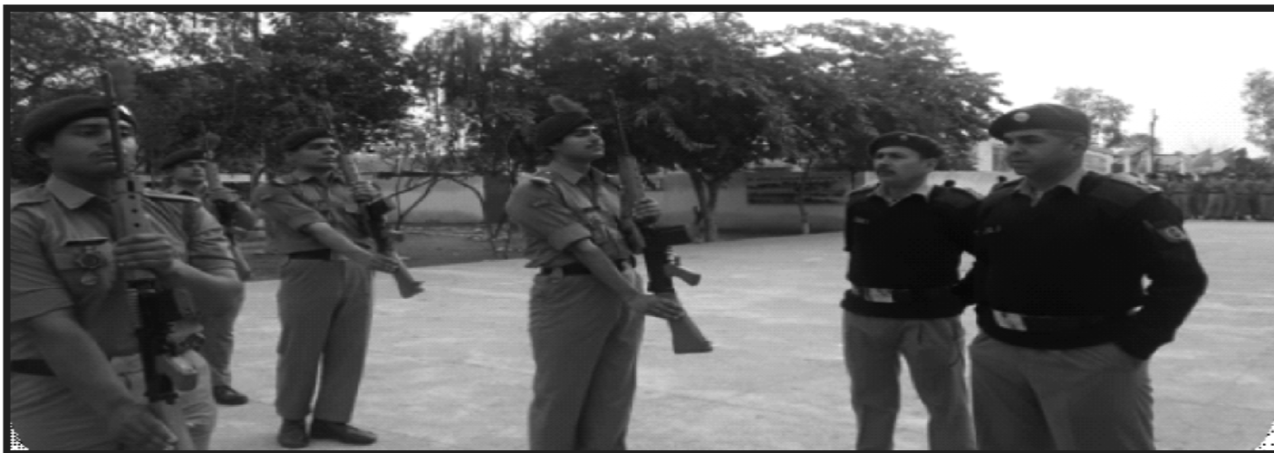
Cadets performing in 'C' certificate examination at camping ground Nagrota

The National Cadet Corps in India is a voluntary organization which recruits cadets from high schools and colleges. The cadets are given basic military training in small arms and parades. The College has 50 vacancies of NCC Cadets. The aim of NCC is: